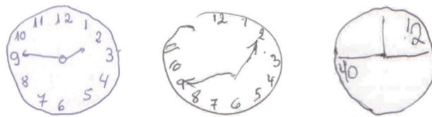
Figure 1. Examples of CDT score in accordance with the specific algorithm method based on Sunderland et al. 10 : 9, 5 and 2 (right to left), respectively.

A summary of the participants’ sociodemographic characteristics, performance on cognitive screening tests, as well as cognitive function and depression scales is given in Table 3. Table 4 shows performance on the CDT.