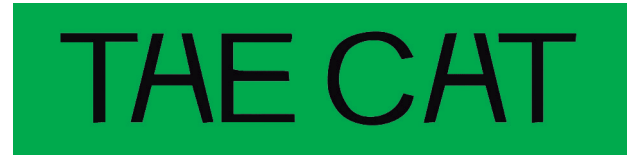
Figure 1. The two words may be easily read as “the cat”, although the H and A have been written exactly the same way. 47

The estimated prevalence of synesthesia in the population has varied greatly as the study of the subject has progressed. Initial studies indicated a rate of 1 in 25,000. 1 In 2006, Simner and colleagues 5 tested two large samples, one comprising 500 and another of 1190 subjects, and diversified the tests to measure different variants of synesthesia. The authors identified a prevalence of 1 in 23, evenly distributed between women and men. However, this estimated prevalence remains imprecise because not all possible variants of synesthesia are known. Sean Day has catalogued more than 65