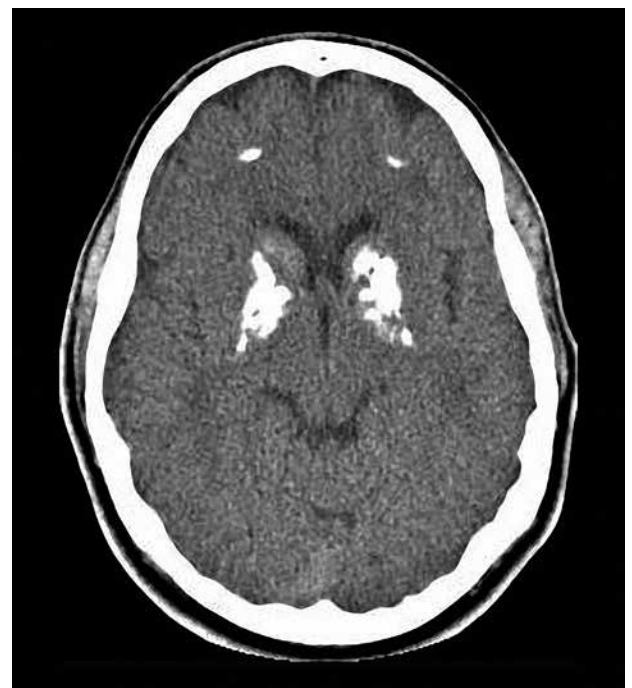
Figure 3. 23 year-old subject with massive brain calcinosis, but only with mild symptoms, suggesting a high level of resilience for brain calcinosis.

We also identified unusual images from subjects with massive brain calcinosis, yet only mild symptoms, suggesting a high level of resilience against brain calcinosis (Figure 3).